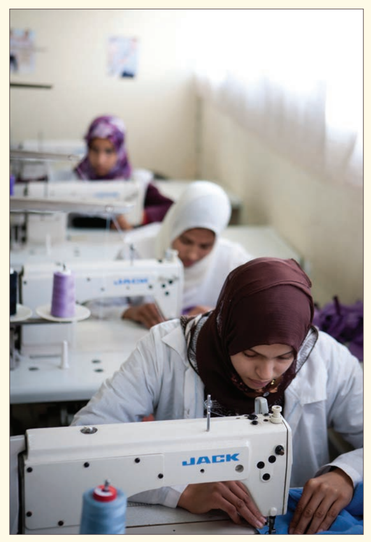
Students learn sewing skills at the Center for Deaf and Hard of Hearing Children in Morocco.

The project focused on four areas: 1) improving the capacity of vocational inclusion services to support young people with disabilities, 2) improving