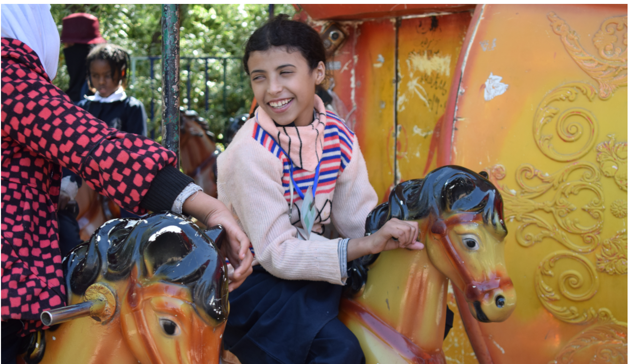
A girl on a carousel during International Day of Persons with Disabilities celebrations in Sana'a.

Some groups of persons with disabilities are also more excluded than others. For example, a significant number of HI's rehabilitation patients are refugees or illegal immigrants who sustained injuries during their displacement, and who often find themselves unable to access the care they need due to their status.