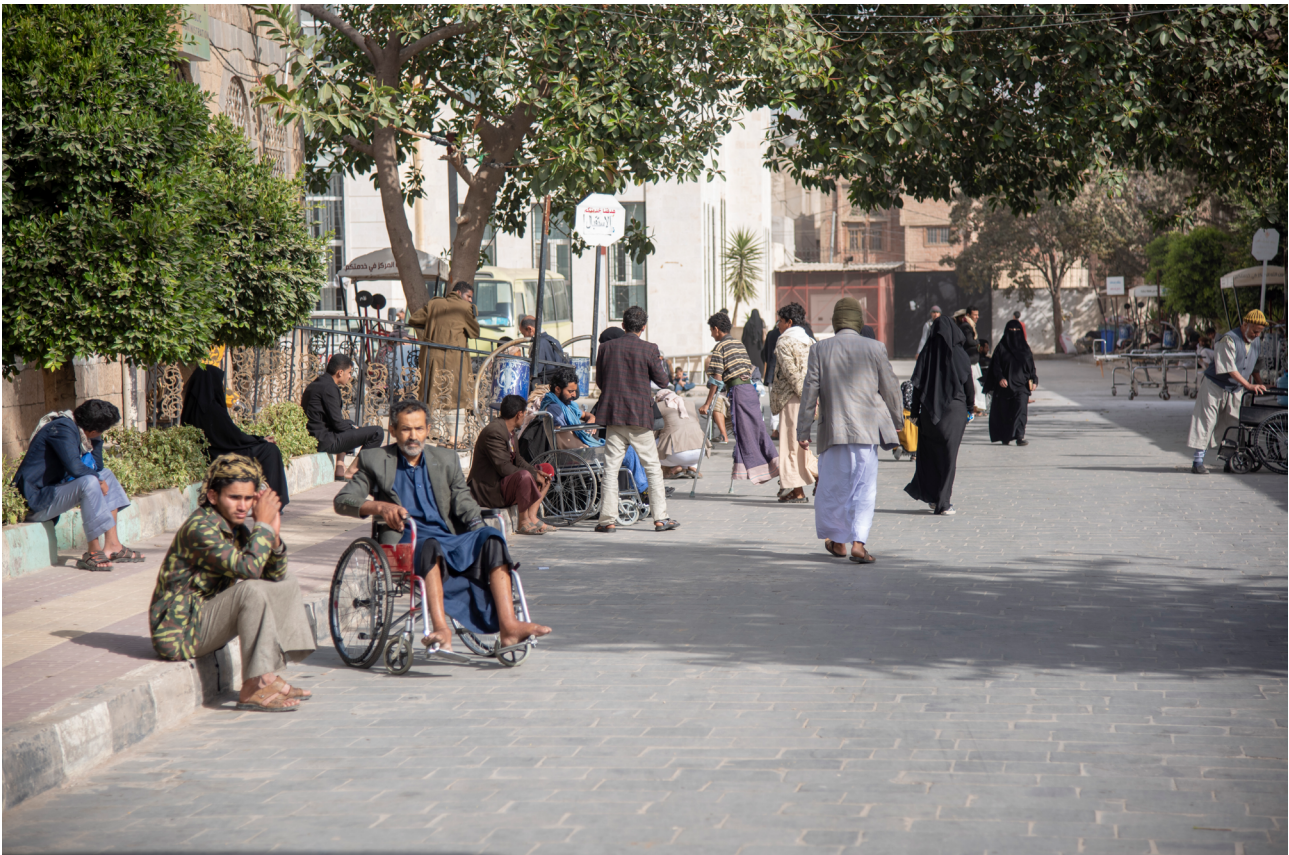
Sana'a residents, some are in wheelchairs.